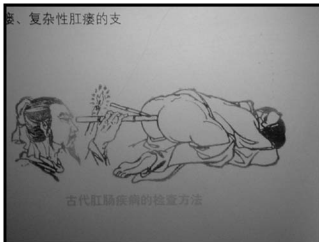
FIGURE 2. Chinese lithograph: Photo taken at the museum in Nanjing University Hospital in Nanjing, China.

There is no way the work of this Society gets done because of a president. It gets done because of an executive