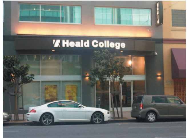
FIGURE 7. Heald College on Howard Street, San Francisco, CA.