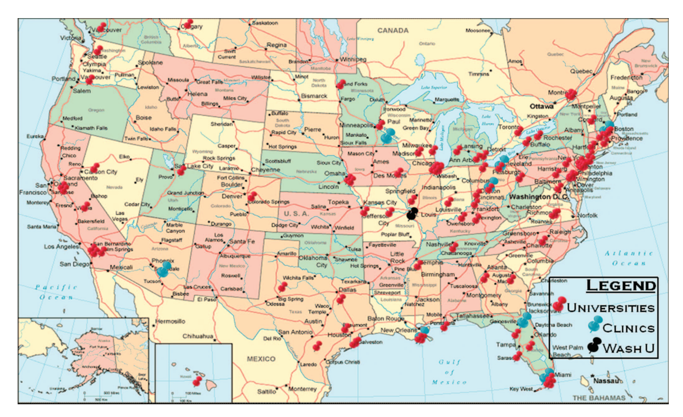
FIGURE 2. Full-time university colorectal surgeons.

that can ultimately make this happen with directed gifts from members themselves and grateful patients. I challenge you to make this independence possible.